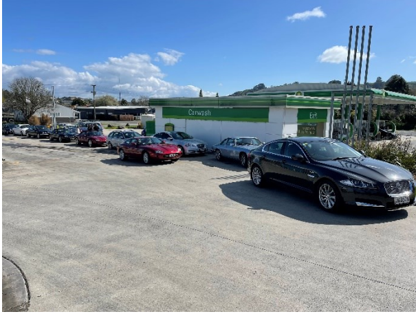
Stop off at Te Kuiti BP