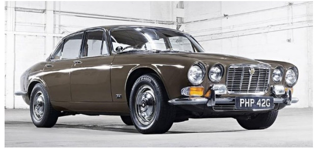
Series 1 XJ6