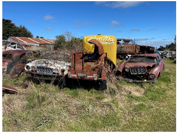
Not so sad cars