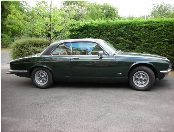
Series 2 Coupe' XJ6