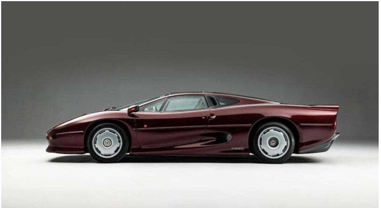
Photo Study of the Jaguar XJ220