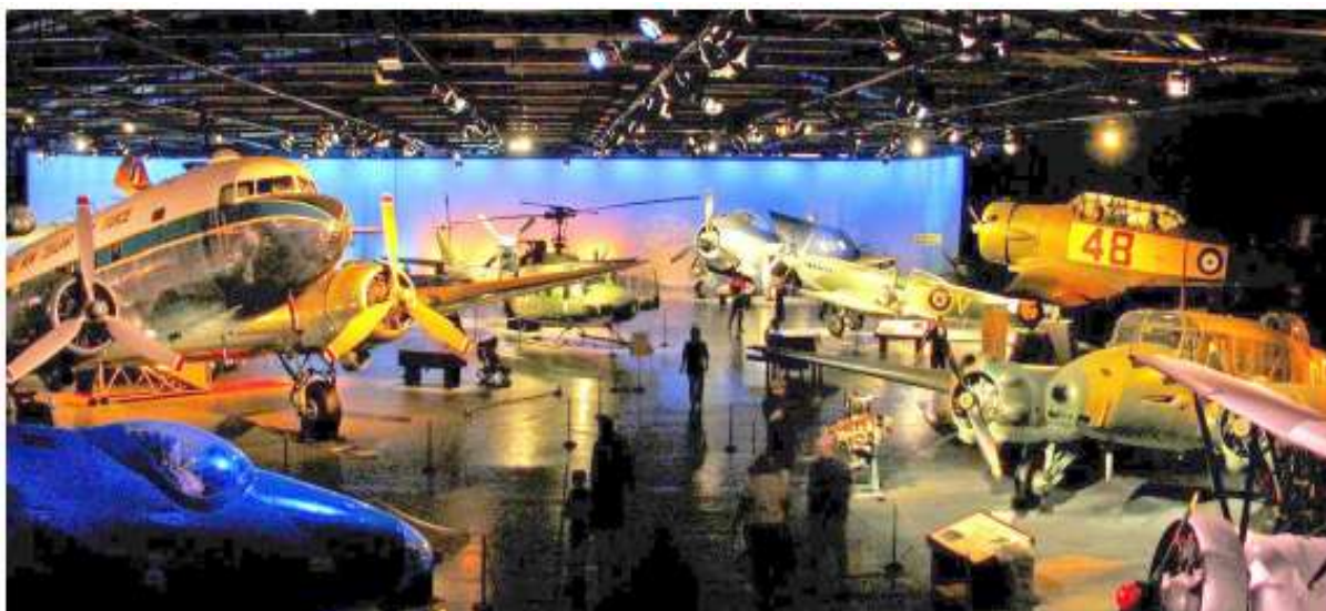
Air Force Museum – Aircraft Hall