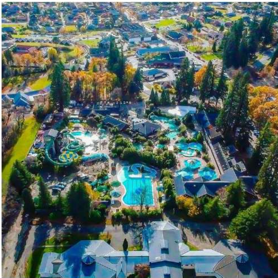
Hanmer Springs Thermal Pools