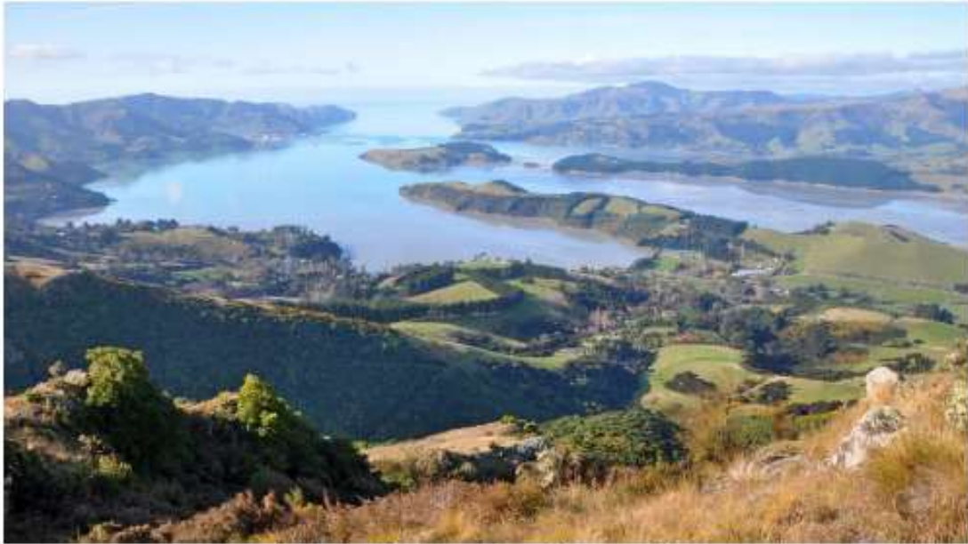
Lyttelton Harbour – from Governors Bay