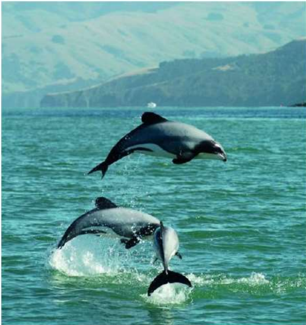
Akaroa's Hector Dolphins