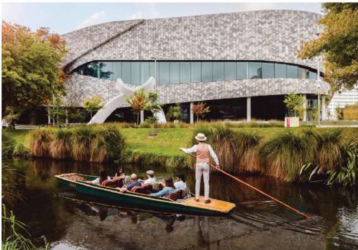
Christchurch's Avon River – Outside the New Convention Centre

Perhaps none of these options suit you. No worries. You are free to simply walk around the city or perhaps take a tram ride. Visit the re-built city. So much development has taken place since the earthquake we know that you will see things that are new to you. You will realise why Christchurch has been named the most sought-after city in New Zealand both for visitors and those moving here permanently.