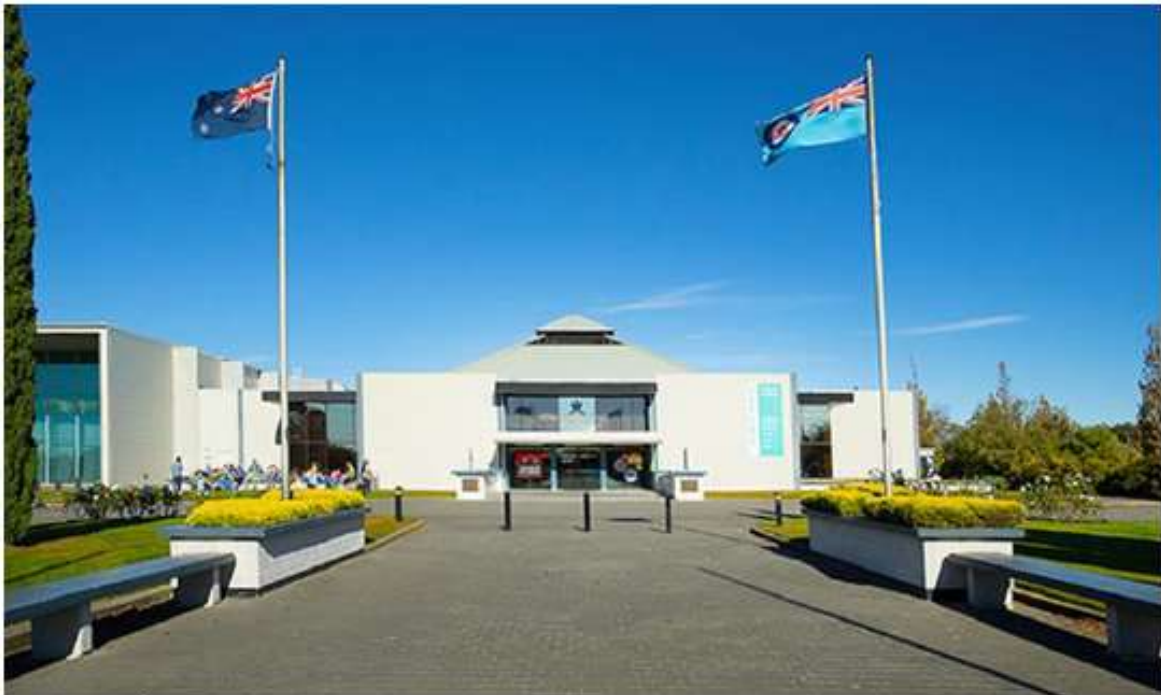
Air Force Museum

As advised already the venue for the weekend is the Air Force Museum at Wigram. Our functions will be set amongst a brilliant collection of historical aircraft. Sprinkled within the complex there will also be a display of some wonderful classic Jaguars – some seldom seen these days.