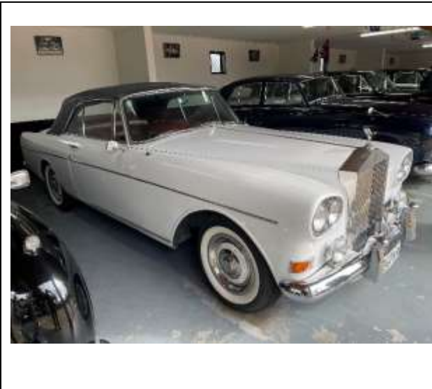
1925 Bentley 3 litre